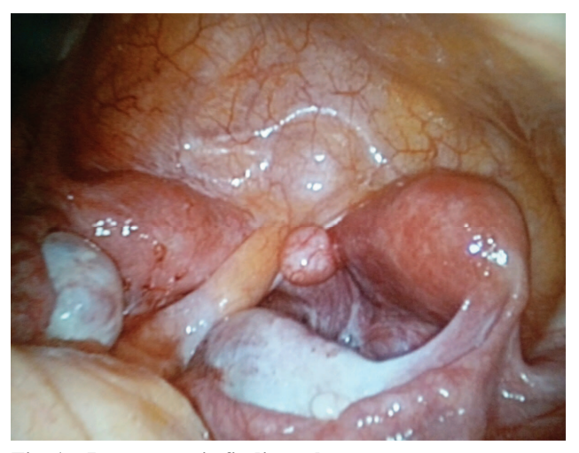
Fig. 1 – Laparoscopic findings shows two separate uterus.

otic implants were seen on the right uterosacral ligament. As cystectomy, which would encompass complete excision of the cyst and its pseudocapsule, was technically difficult to perform, incision and drainage of the cyst was done instead, followed by biopsy and coagulation of endometriotic lesions. The subserous fibroid was excised. Both specimens were sent for the histopathological analysis. Chromopertubation, using methylene blue dye, was performed to assess tubal patency; spillage of the dye from the right tube into the abdomen indicated the patency of the right tube while the left tube filled up without spillage and was determined to be occluded at the uterine horn. Postoperative recovery was uneventful. The patient was discharged from the hospital on the second postoperative day. Pelvic magnetic resonance imaging (MRI) with paramagnetic contrast was performed postoperatively. The MRI findings confirmed a uterus didelphys, which consisted of two non-communicating uterine cavities and two cervices. A partial septum was found in the proximal third of the vagina. The MRI is shown in Figure 2.